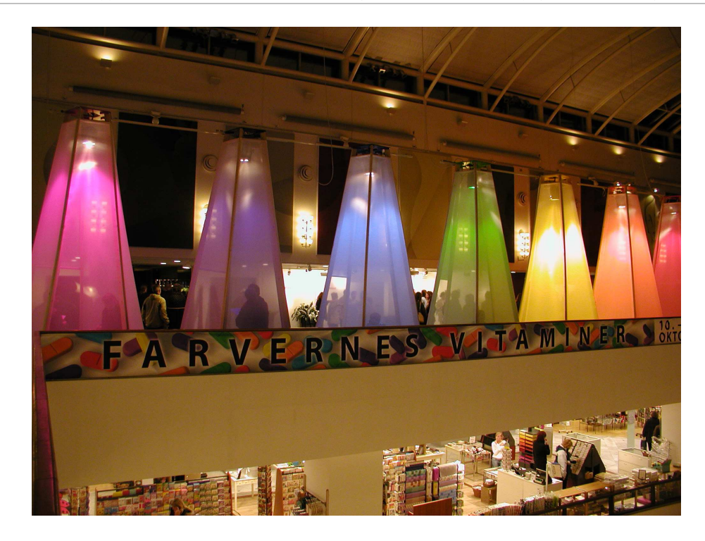
Colour exhibition "The Vitamins of Colour" in ware house Illum Copenhagen 2002 / 2003 which attracted over 30.000 visitors in which experiments were done with the public in lighted up Spectrum tents.