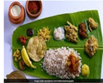
Fig.9 Leaf Plates

The general practice in India, people generally take food on leaf plates such as on banana, dhaka, betel palm and teak plant leaves by sitting on the floor. They are called “Pattal or Vistarlu”. They are hygienic and biodegradable. In some rituals it is mandatory to offer food on leaf plates for Brahmins. The conventional leaf plates are superior to plastic plates.