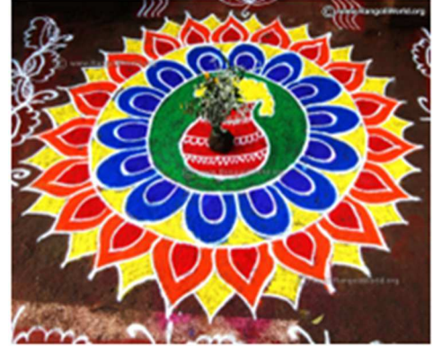
Fig.3 B . Rangoli

It is the general practice in Hindu families that everyday morning, the front portion of the house, the open place is swept and cleaned with water; and especially in rural areas, they use even cow dung to wipe out dirt and insects. Before performing morning and evening prayers, it is mandatory in Hindu families to clean and mop the houses every day, using detergents to remove dirt, dust, and insects for a hygienic atmosphere in the house.