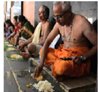
Fig.8. Eating on Floor

Earlier days, people were comfortably taking food by sitting on the floor. They were feeling healthy and maintaining a good physique. There are many benefits such as digestion, blood circulation and reduces muscle and joint pains. They sit on the floor with crossed legs (Sukhasana) before the meal plate (Leaf plate) and move the body front and back to take food. These repeated movements will activate abdominal muscles, which increase the secretion of stomach acids and allow food to digest faster. It is said that Sukhasan increases blood circulation and evenly distributed in the body. This posture reduces the muscle and joint pains in the legs and gives flexibility in the body and feel you feel comfortable. 27 This is still prevailing in traditional families.