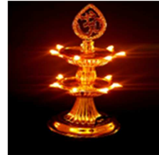
Fig 4. Lighting a Lamp

We are in a world of darkness. The light leads us from darkness to enlightenment. It symbolizes the presence of goddess Laxmi and goddess Sarswathi. 8