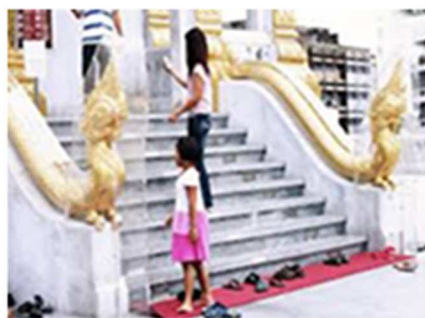
Fig 3 Remove shoes

One must remove shoes and socks before entering the house and temples. (Fig.3) One must be pure of the purest form to enter into the sanctity place at religious places. The Supreme Lord in Bhagavad-gita says