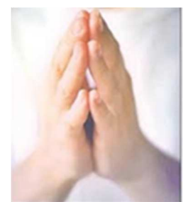
Fig 1 : Namaste

Namaste or Namaskar is a special type gesture to greet each other when two people meet each other. Every living entity has a soul and a super soul. It implies "I bow to the Supreme Lord in you". It means "The Supreme Lord in me recognizes the Supreme Lord in you". In other words, two souls are coming to unite for fruitful discussions. Namaste is usually spoken with a pleasant voice by slightly bending and hands pressed together, palms touching and fingers pointing upwards, thumbs close to the chest. This mode of greetings avoids physical contact of persons and stop spreading infections. It is being followed by most people in the world after the outbreak of Coronavirus.