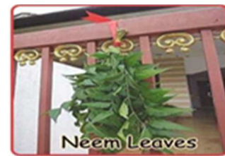
Fig 11. Neem Leaves

The Neem trees are abundantly seen in India. It is a medicinal plant, known as the divine tree and Village Pharmacy tree. They increase the fertility of the soil, the neem oil, or neem water is used as a pesticide. The twigs are used for cleaning teeth, the leaves reduce the boils, rashes, and wounds, they are placed near and under the patient as insect repellent who is suffering from chickenpox. The leaves are placed at the entrance of a door to protect harmful insects, viruses, and bacteria.