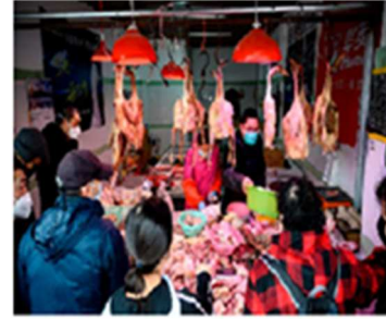
Fig 12. Meat Shop

As per Hindu customs killing animals is a crime and eating meat is a double crime. The designated place for dead bodies of humans and animals is graveyard. But people are buying meat (pork, beef etc.) from unhygienic slaughter centres, keeping in houses that too in refrigerators, then frying them as mouth-watering dishes and finally eating and storing in human body for digestion. In this context lot of questions arise: