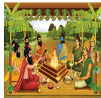
Fig 7 . Yagnas

A Yagna is a powerful ancient method of ritual to satisfy Supreme Lord Vishnu by reciting sacred Vedic verses through the fire of