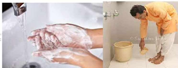
Fig.2 Cleaning Hands and Feet

The well-known concept is "Cleanliness is next to Godliness".