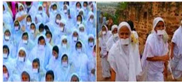
Fig. 10 B. Jains use Mask

It is an etiquette to use masks or put a hand before the nose and mouth while speaking with someone so that droplets will not fall and cause infections to others. The main traditional reason is the concept of Ahimsa, one should neither kill nor eat and inhale the air which contains germs or insects. This is still strictly followed in Jainism and orthodox families. They wear masks, especially during the Sunset period.