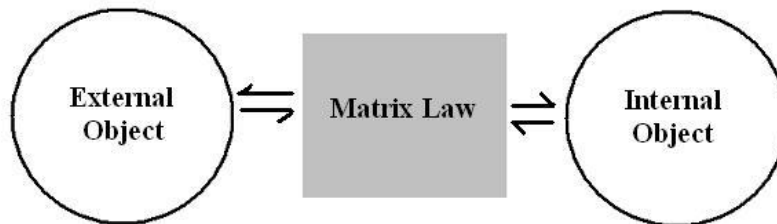
Figure 2.3 Self-interaction between external object in the external spacetime and internal object in the internal momentum-energy space

Figure 2.3 shows from another perspective of the relationship among external object in the external spacetime, internal object in the internal momentum-energy space and the self-acting and self-referential matrix law. According to prespacetime-premomentumenergy (Consciousness) model, self-interactions (self-gravity) are quantum entanglement between the external object and the internal object.