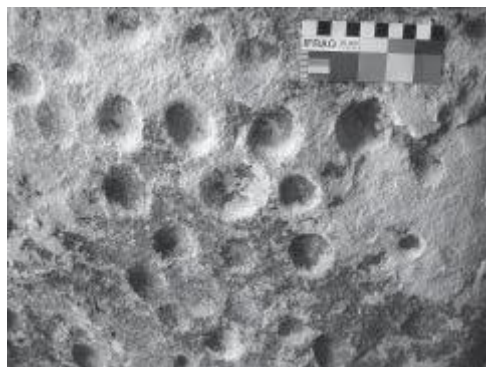
Fig. 8. Some of the more than 500 Paleolithic cupules in Daraki-Chattan, India, thought to be of the Acheulian or Middle Paleolithic.

This is why from the beginning of Lower Paleolithic until the end of the first half of Middle Paleolithic, there have not been huge variations in the type of products realized by human's hand, even though the variations that there have been, however slight, are nonetheless an evidence of the fact that human psyche was undergoing the slow psychological process of individuation which would be led to the settling of a state of consciousness , with all the consequences that we observe in the findings dated from the second half of the Middle Paleolithic onwards.