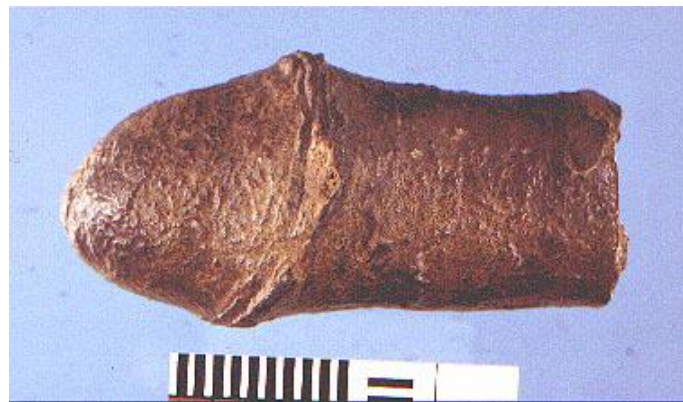
Fig. 6a The Erfoud manuport , from a Late Acheulian dwelling in Morocco.

Utilitarian finds from the second half of the Lower Paleolithic are artifacts that provide some likely clues on Paleolithic humans migration flows (a series of quartz stone axes, found in Crete and dated between 800 to 130 TYA suggest that already from the second half of the Lower Paleolithic perhaps Homo erectus and certainly Homo heidelbergensis built rudimentary boats for sailing in the open sea) [23]; stone tools ( choppers, bifaces, scrapers, handaxes and spikes )