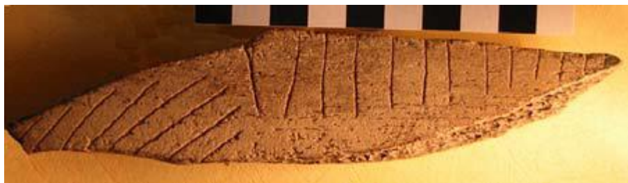
Fig. 7. Bone fragment with two sets of sub-parallel lines engraved with stone tools, from the Oldisleben 1 site, Germany, of the Micoquian, and possibly in the order of 120,000 years old.

In this regenerative and representative psychophysical process, the undivided unity composed by the individual and its natural habitat is cleaved into a territory and its mapping. In the tension, fraught with uncertainties, created by this splitting, the (quasi)absence of intentional supra-adaptive purposes 14 in early humans is facing and integrates with the rising humans' state of consciousness 15 , and from its anthropo-centric orientation flows the fully supra-adaptive behavioral which we call, to all intents and purposes, cultural production .