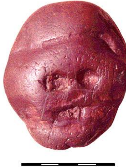
Fig. 6. The red jasperite manuport from Makapansgat Cave, South Africa, 2.5–3 million years, the oldest known palaeoart object in the world.

of a fossilized fragment of a cuttlefish with natural phallic resemblance, from an archaeological site near the towns of Erfoud and Rissani in eastern Morocco (Fig. 6a), which was collected by a hominid some 300 TYA [22]; an engraved bone fragment from the Acheulean of Sainte Anne I, France, which bears ten short cuts along an edge.