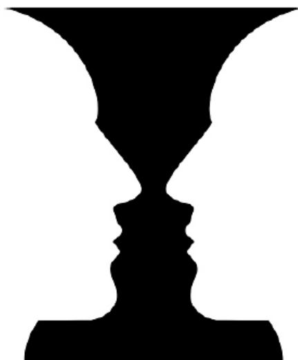
Figure 1. Optical Illusion.

Something must be strangely said about the very unusual experience of hearing a pitch-inverted song for the very first time. In some cases the music comes out as not sounding right, confusing, and more like a failure showing less than the expected 100% success rate now reported. Some of this is due to small errors that end up getting corrected, and doing the inversion by hand can introduce errors. However, this can't be the only reason for the initial confusion. Its like looking at the Figure 1 below, and getting confused about seeing a vase or two opposing faces.